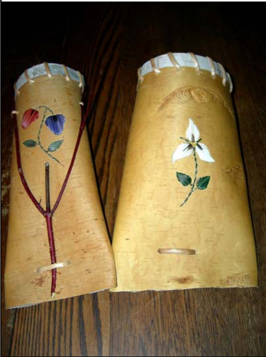
Birch bark and porcupine quill baskets by Ron Paquin

subject in the environment that surrounds it . . . these images on a wall are like a window and the trees they portray can become a sort of enduring companion that has a real presence. . . It is my goal that we would learn to appreciate the individual tree that may otherwise be lost in the forest. See additional photo on page 10.